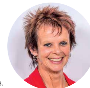
THE RT HON ANNE MILTON MP Minister of State for Apprenticeships and Skills

I would encourage charity employers to use this guide, to help them make the most of apprenticeships in their organisation.